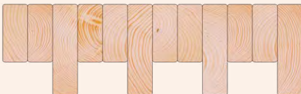
Alternating Staggered Depth Cross-Section